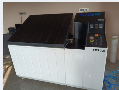
SALT SPRAY TEST MACHINE