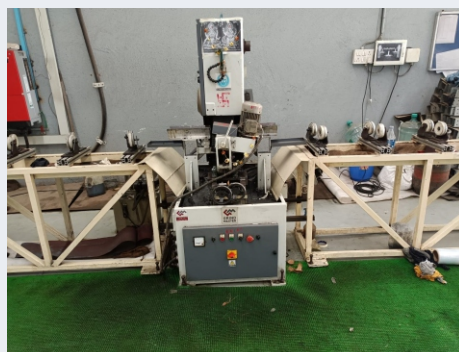
BELT POLISHING MACHINE